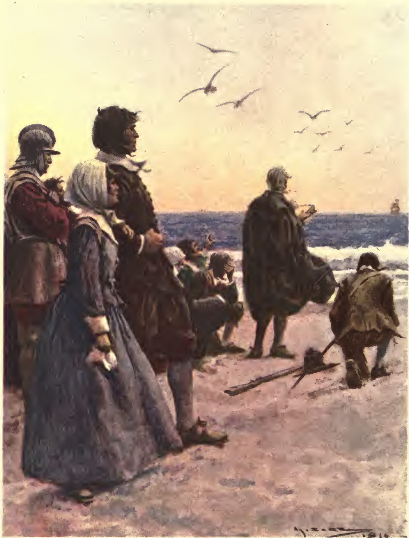
THE DEPARTURE OF THE MAYFLOWER

With tears streaming down their faces the Pilgrims knelt upon the shore and saw the Mayflower go.